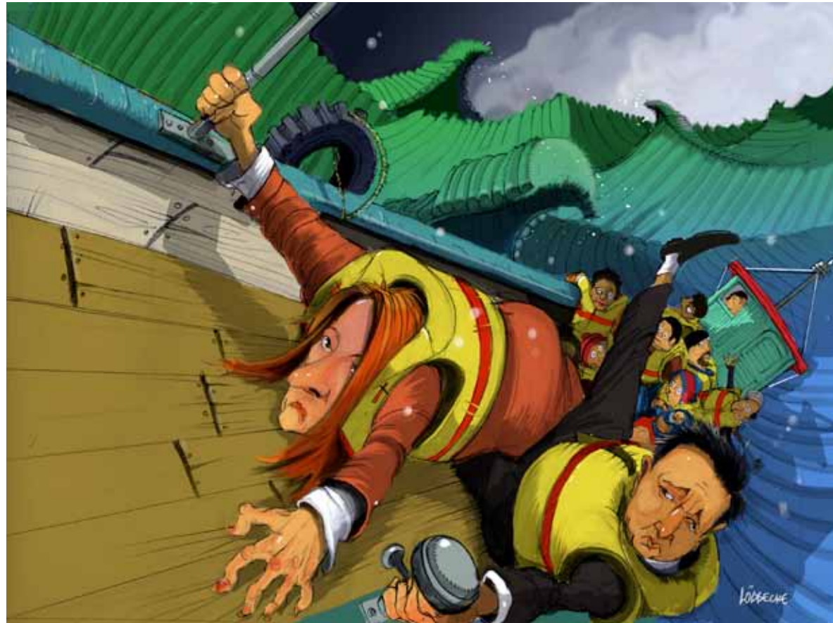
Eric Lobbecke The Refugee Storm 2011 33 x 24.7cm

THE BELGIAN EMBASSY, CANBERRA • 24 NOVEMBER - 26 NOVEMBER 2011