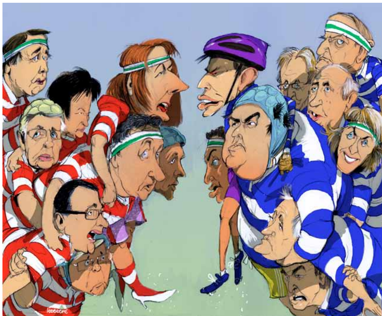
Eric Lobbecke The Rugby SMALLWORLD Cup 2011 30 x 24.7cm