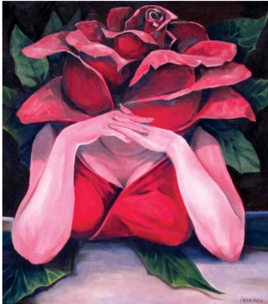
Eric Lobbecke The Rose 2011 Oil on canvas 40 x 45 cm