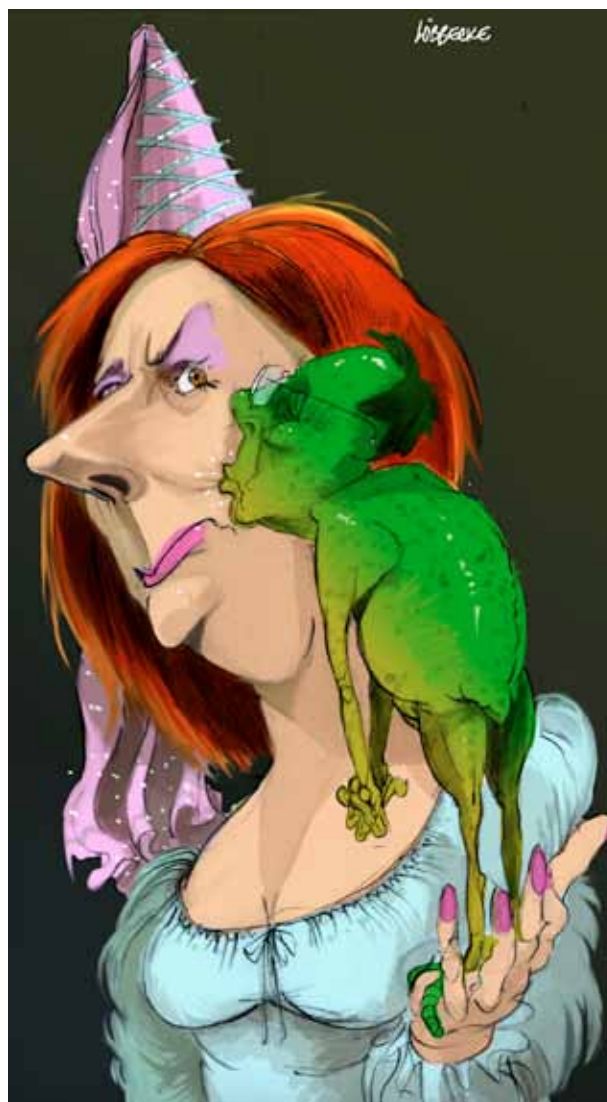
Eric Lobbecke The Green Kiss 17.8 x 32cm 2011